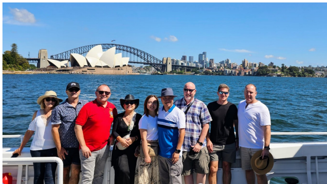
IP with the NSW Committee